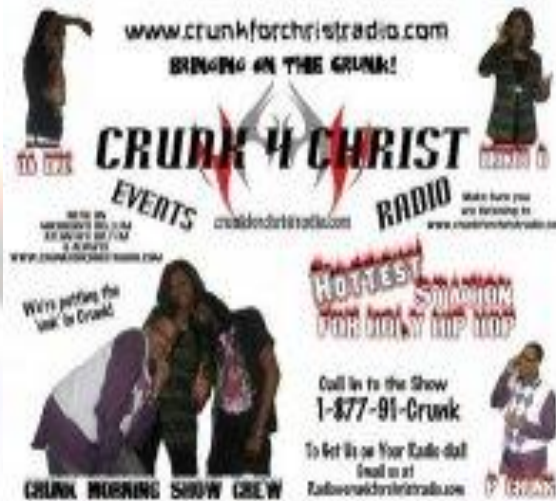
"Crunk 4 Christ Radio Station"